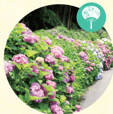
Sakasedani/Ajisai MAP Around H-4 [Best time to see] From early June to late June