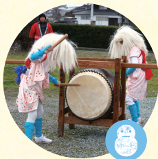
Chitoku area / Kumano shrine Kodomo furyu MAP Around B-7 Hirokawa Kofun Festival or December 16