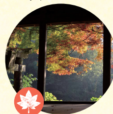
Sakase no omiya/ Koyo MAP H-4 [Best time to see] From mid-November to late November