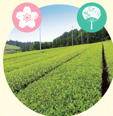
Ota Tea plantation / Tea plantation MAP C-9 [Best time to see] Late April to mid May