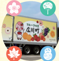
Kurume / Hirokawa new industrial complex / Hirokawa Machiko chan track MAP C-5 [Best time to see] All year round