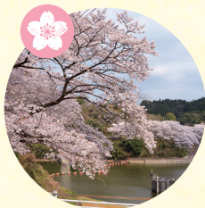
Hirokawa dam/ Cherry blossom trees MAP I-7 [Best time to see] From late March to early April