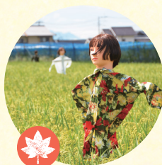
Taibaru area/Scenery with scarecrow MAP Around D-6 [Best time to see] From early September to late September