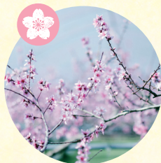
Peach Forest / Peach Blossom MAP B-5 [Best time to see] From early March to mid-March

Introducing photograph spots in Hirokawa town! Because there is a nature rich environment in Hirokawa town, it is such a wonderful place to take photos!