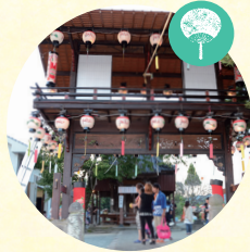
Masunaga area/ Chogiri Gion Festival MAP E-8 On the 4th Saturday of July *Once in 2 years